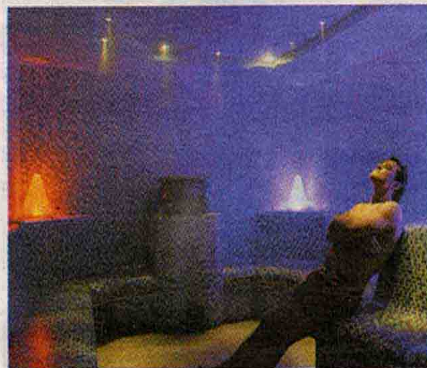
Deep blue: Titanic Spa in Huddersfield (No 26)